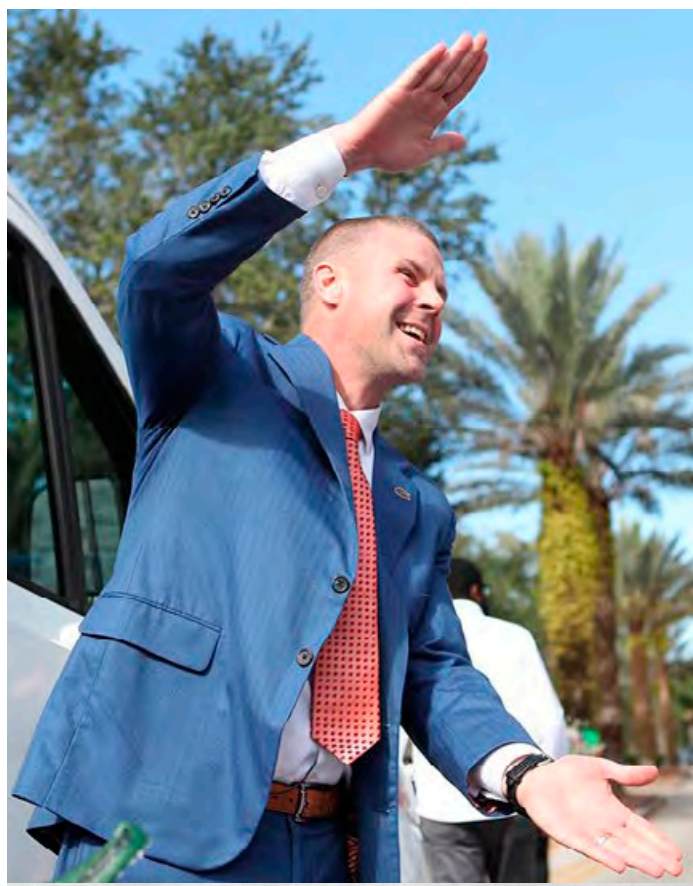
BILLY NAPIER compiled a 40-12 record in four years as head coach at the University of Louisiana Lafayette.

Napier's deep roots in the game include stints on both Clemson coach Dabo