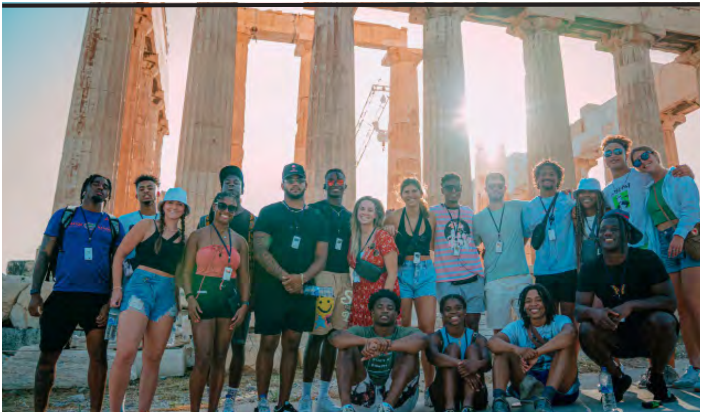
SIXTEEN GATORS SCHOLAR-ATHLETES traveled to Greece this summer for a 10-day service trip.

"This is an area where people can invest in the player. And at the University of Florida, with the alumni network that we have and the top-five university education that we offer, there's no reason we can't do just that." - Head Coach Billy Napier